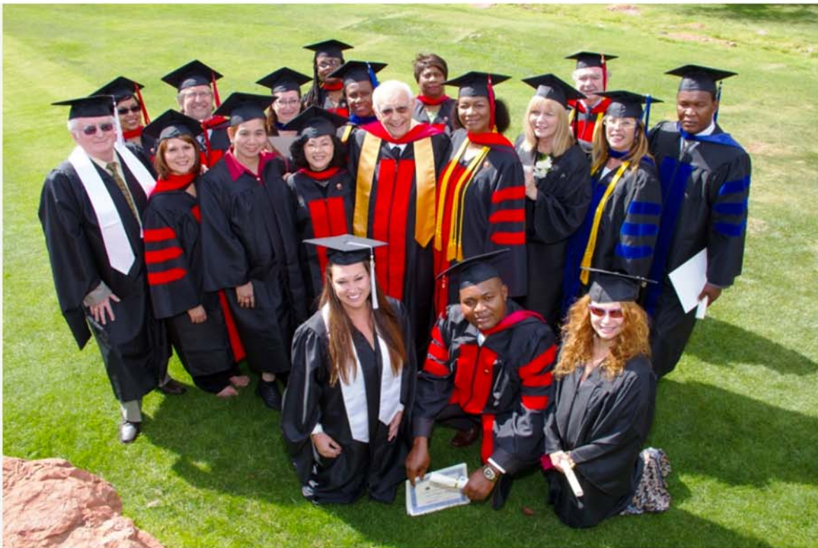
Some of our international 2013 graduates representing Nigeria, Canada, Australia, South Africa, Botswana, Austria, Malaysia, Trinidad, and Israel.

You're invited to join the University of Metaphysics or the University of Sedona with over a half century of experience in Higher Consciousness Education.